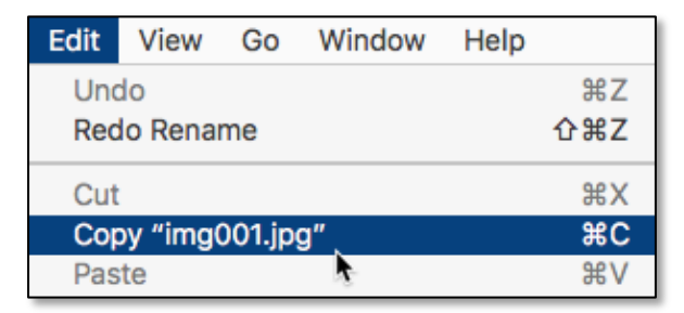
Finder - "Copy"

Copy Using the Finder's Edit Menu. Instead of dragging an item in the Finder, you can use the Copy and Paste menu items under the Finder's Edit menu. First, select an item from the Source location. Then choose Edit > Copy file/folder name :