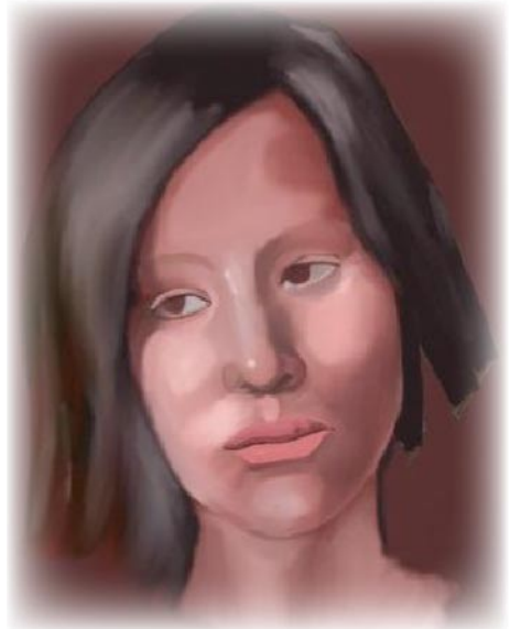
Simulate traditional media --KMSM