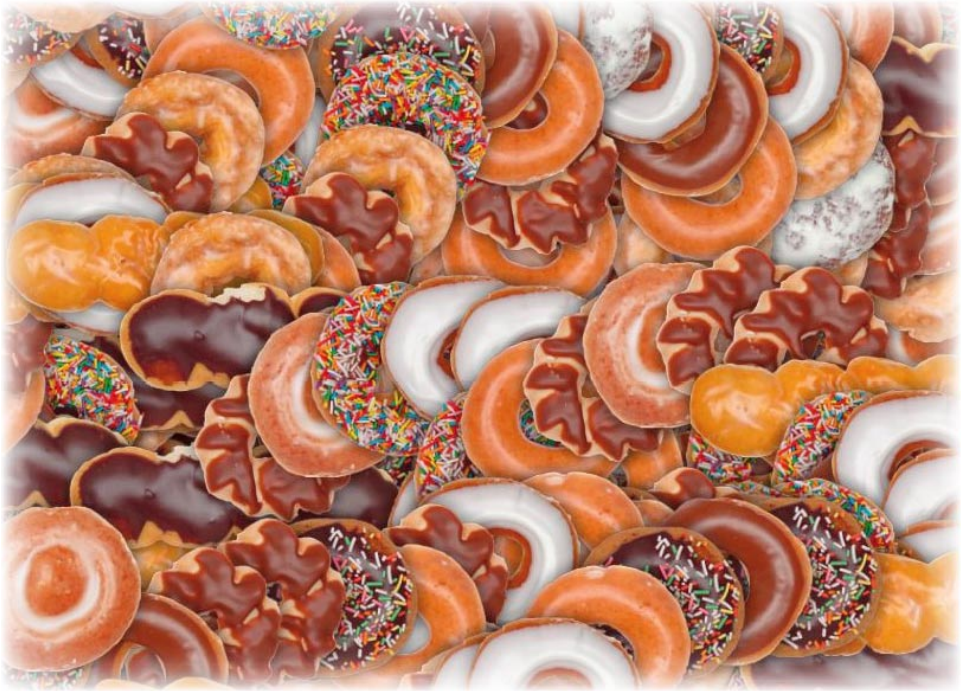
Paint with images using the image hose tool. --KMSM