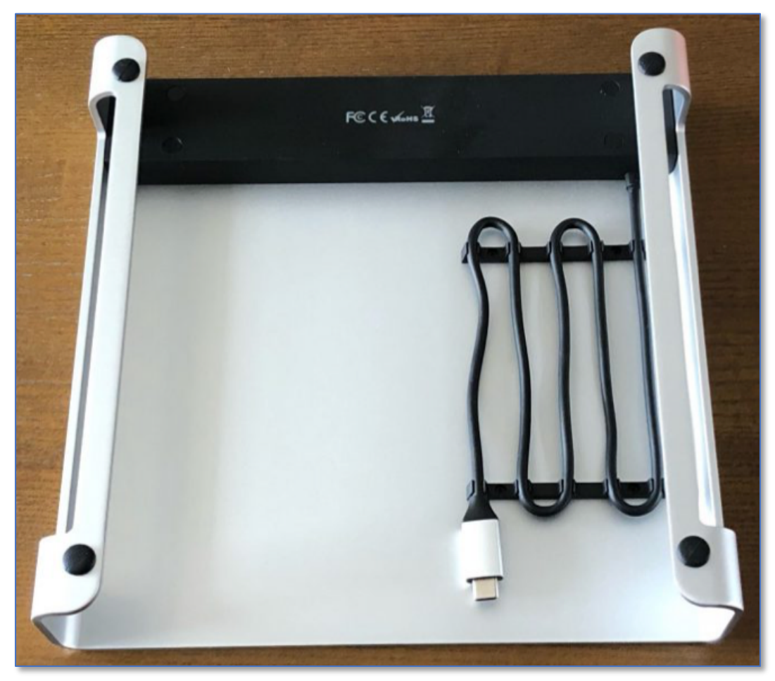
Underside of Monitor Stand Hub

Underside of the Stand. On the underside of the stand, is a cable with a USB-C connector: