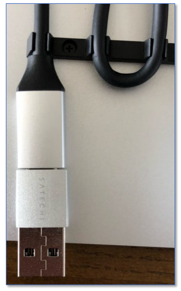
Adapter Connected to the Cable (Result: USB-A Connector for an Older iMac)