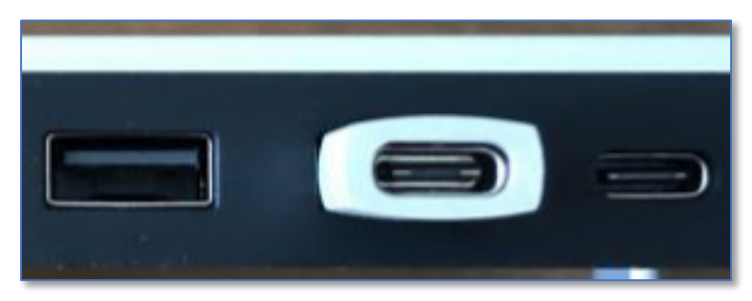
Adapter Plugged Into a USB-A Port (Result: Converts a USB-A Port to a USB-C Port)

Another use for the Adapter is to create a second USB-C port: