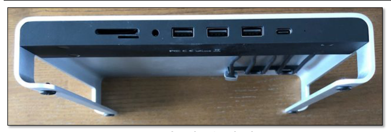
Front of Monitor Stand Hub