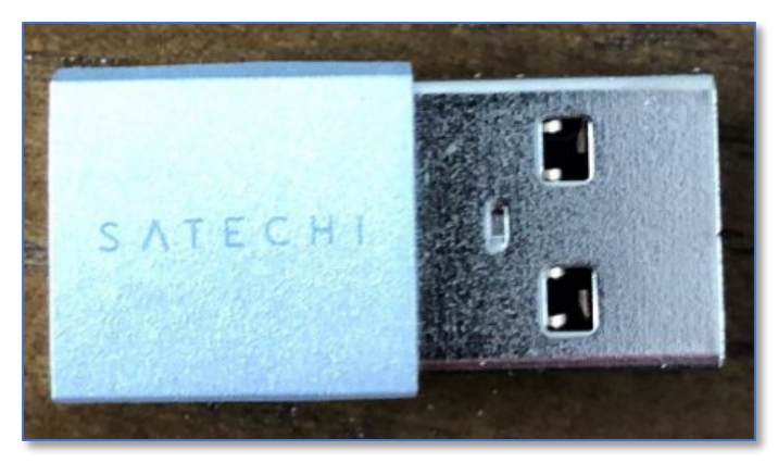
USB Type-A to Type-C adapter

USB Type-A to Type-C Adapter. What if your iMac is an older model, like mine, that doesn't have a USB-C port? Satechi includes a USB Type-A to Type-C Adapter: