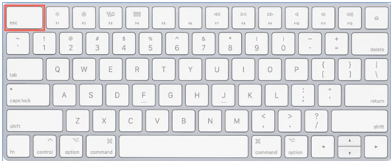
App Switcher (Use the Esc key to leave)

Drag and Drop with the App Switcher. You can use Drag and Drop with the App Switcher to open a document. This can be handy if you wish to open a document that can be opened by more than one app—say, a PDF document that can be opened by both the Preview and Adobe Reader apps. This is useful when you don't want to open it with the default app is set to normally open it (say, opening a PDF with Adobe Reader when the default app set for PDFs is Preview).